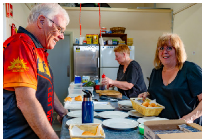
ABOVE: Tailem Bend RSL.

I was also blown away by the volunteer effort being made to improve the facility both inside and out to ensure the building is fit for purpose and welcoming for all. The work being undertaken to modernise this facility is to the great credit to the dedicated band of RSL members and volun-teers and I congratulate them on their achievements to date.