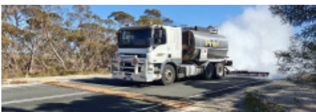
Above: Reseal works on Kulde Road, Taillem Bend.

The Sealed Roads Renewal Program has seen spray-seal works commence on 18km of Kulde Road at Taillem Bend, as well as 1km on Old Dukes Highway at Moorlands and 350m of Pettet Road at Meningie.