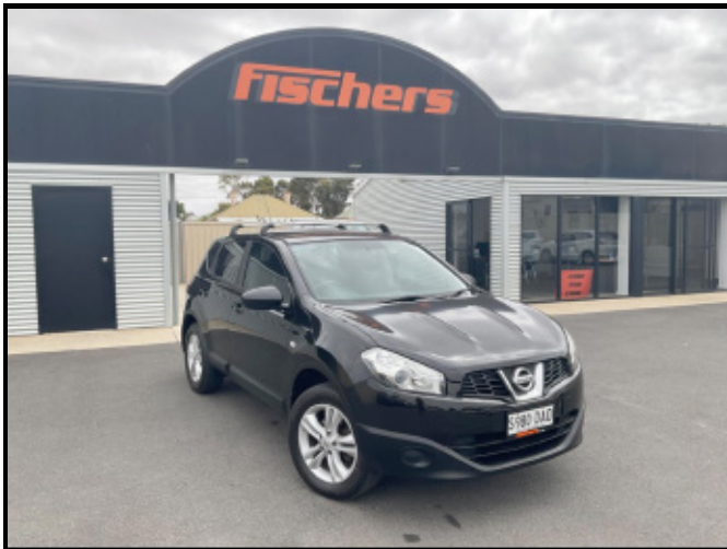
2013 Nissan Dualis $8999