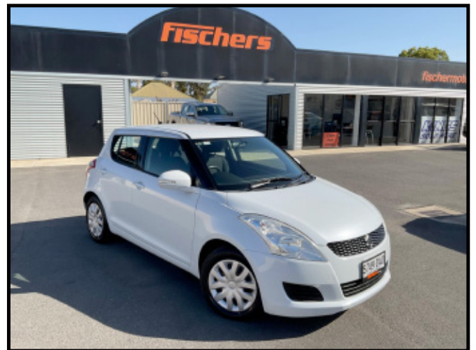
2011 Suzuki Swift $11990