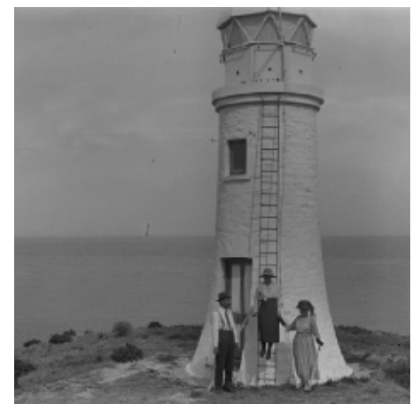
Above: Historic Point Malcolm Lighthouse