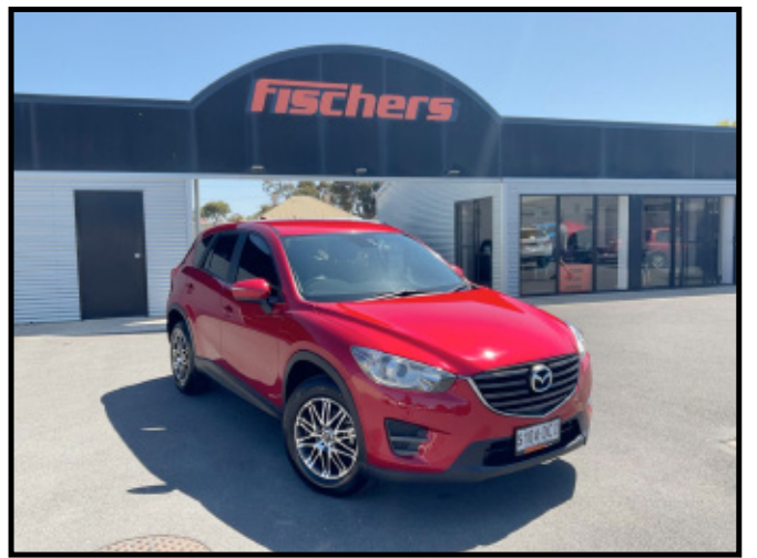
2016 Mazda CX-5 $15995