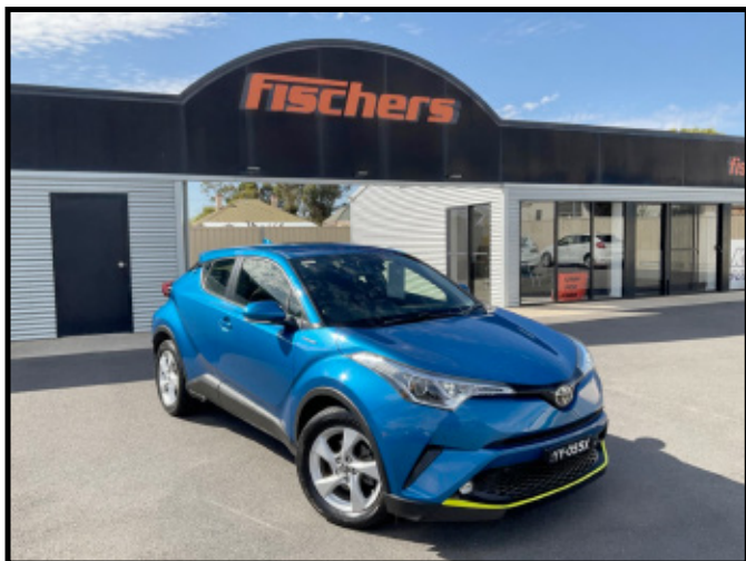
2017 Toyota C-HR $14999