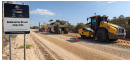
Above: Cement stabilisation underway on Carcuma Road, Tintinara.

Cement stabilisation and final seal works for stage two of the Carcuma Road upgrade at Tintinara have been carried out through February.