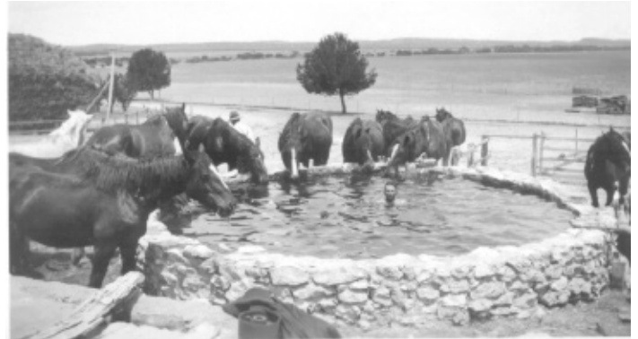
ABOVE: Rider and horses cooling off near Coomandook.

Basics, such as water were miles away and the quality was not the best, Dysentery being a health issue.