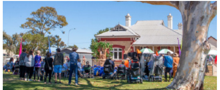
ABOVE: Community members and students from the Tailem Bend Primary School gather under one of the town's majestic gums, for the re-opening of the Station Master's House.