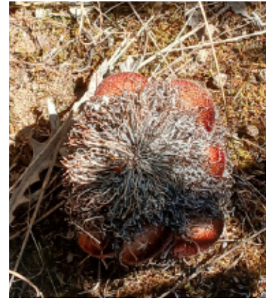
ABOVE: Photo of Banksia repens another prostrate Banksia Flowers out from the foliage. Seed capsules also.