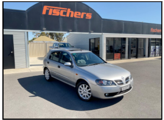
2005 Nissan Pulsar $7980