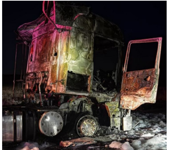
ABOVE: A truck cab has caught fire just outside of Taillem Bend on February 12.

The Mallee Highway was temporarily closed but had reopened to a single lane by 9am; emergency services were expected to remain in and around the area for a little longer.