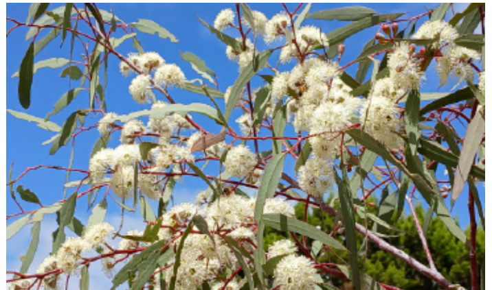
ABOVE: Photo of Euc sheathiana.