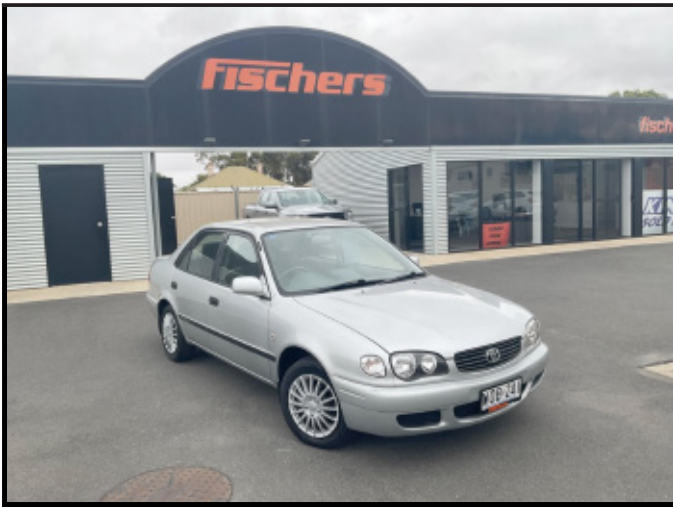
2001 Toyota Corolla $6980