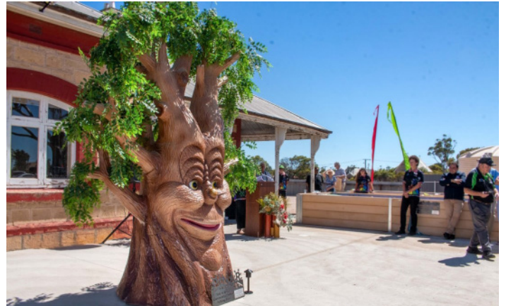
ABOVE: Introducing, Pino the Canoe Tree at the re-opening of the Station Master's House.